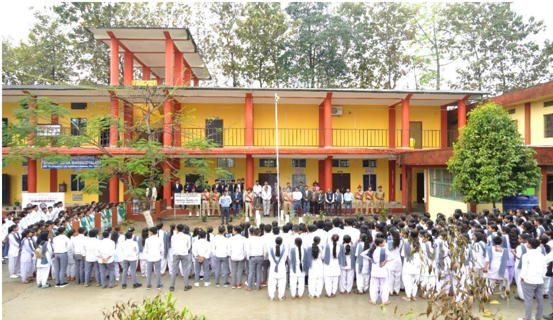
Teacher-Student Assembly during NAAC Peer Team visit, 2023