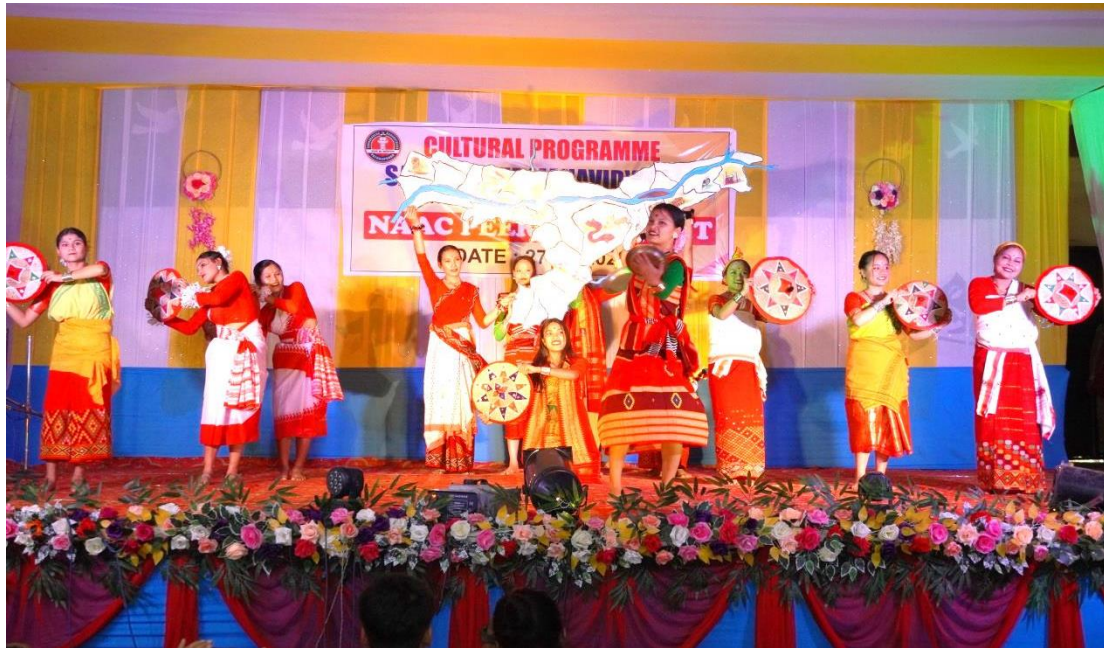
Students Participation in Cultural Programme during NAAC Peer Team visit, 2023