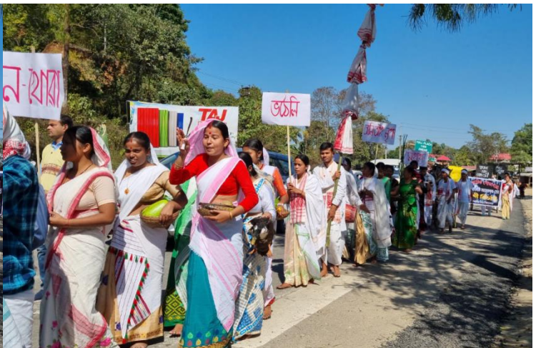
Cultural Procession at 40 th College Week