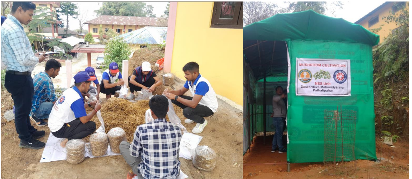
Mushroom Cultivation Training at College Campus