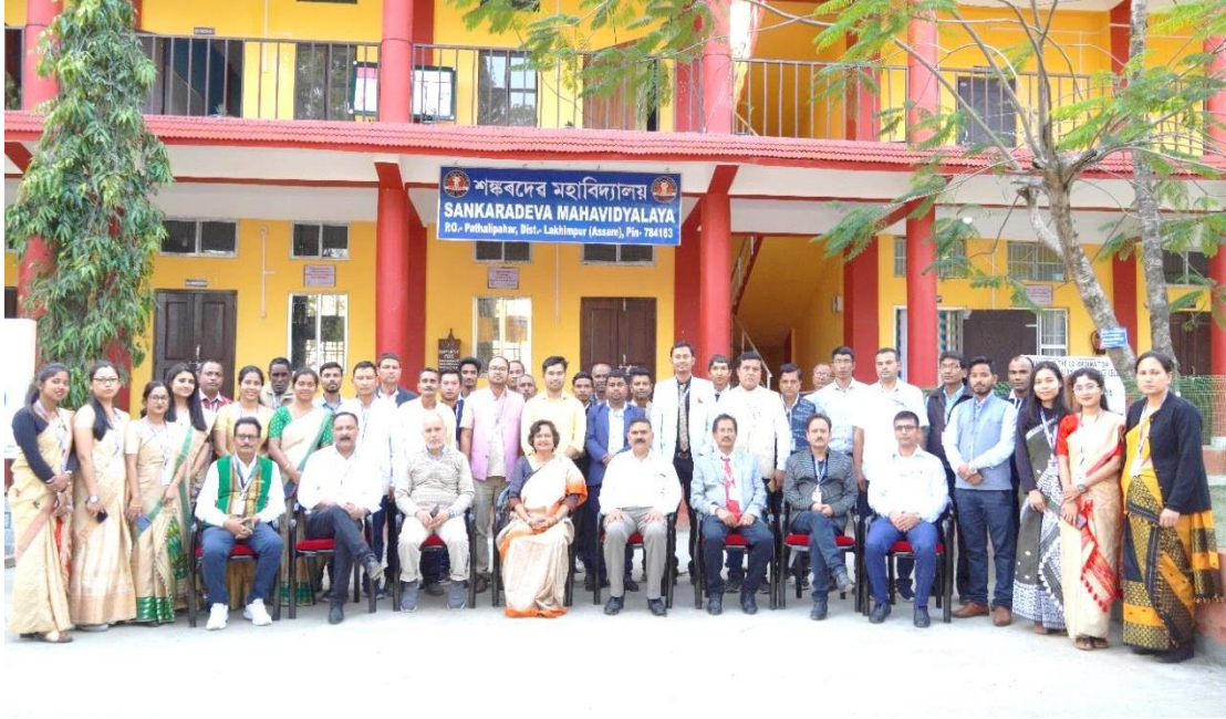
Faculty and Staff with NAAC Peer Team, 2023