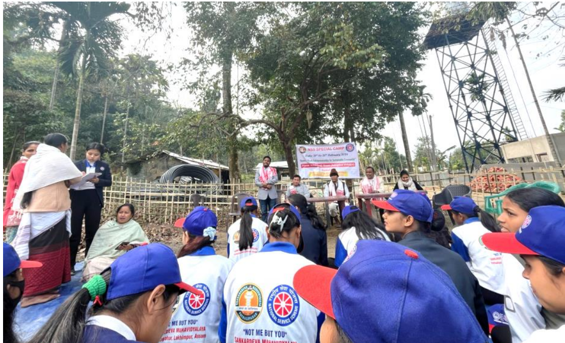
NSS Special Camp at Milanjyoti Gaon (Adopted Village)