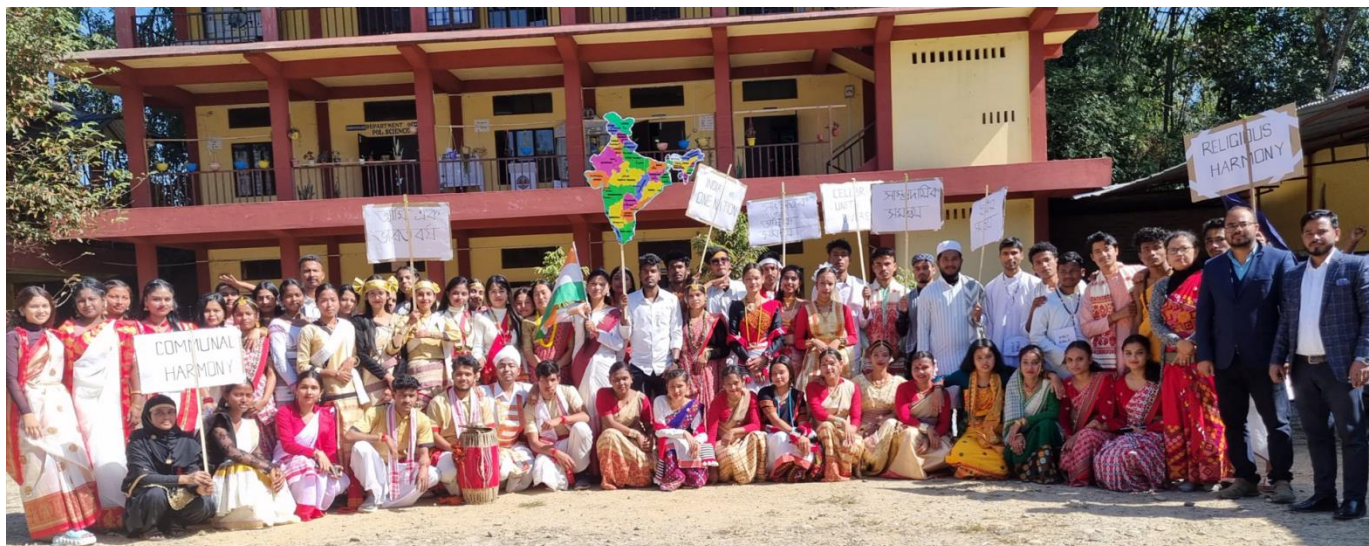
Best Department Award of the College 2023-24 (Department of Political Science)