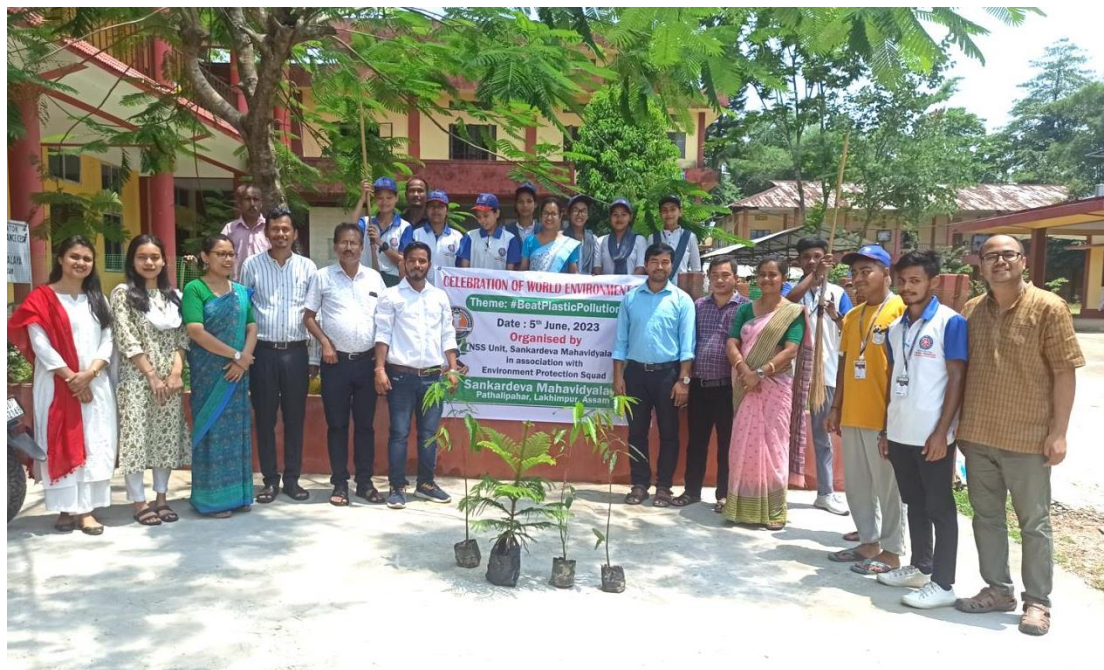
Celebration of World Environment Day